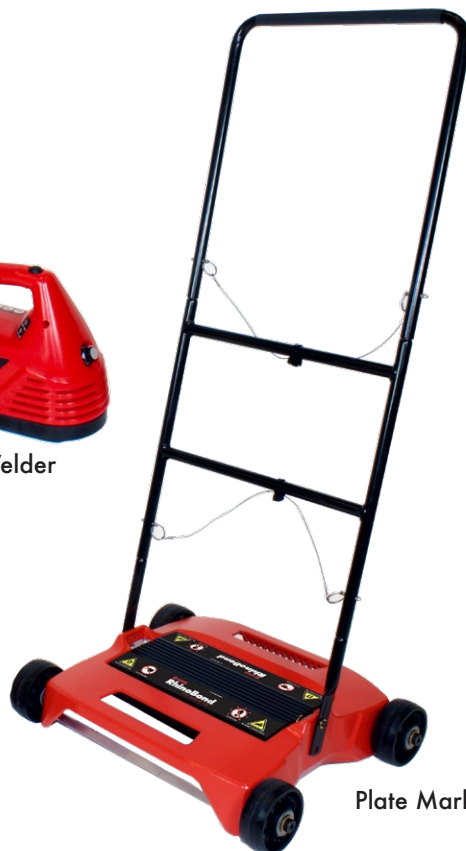
Plate Marking Tool